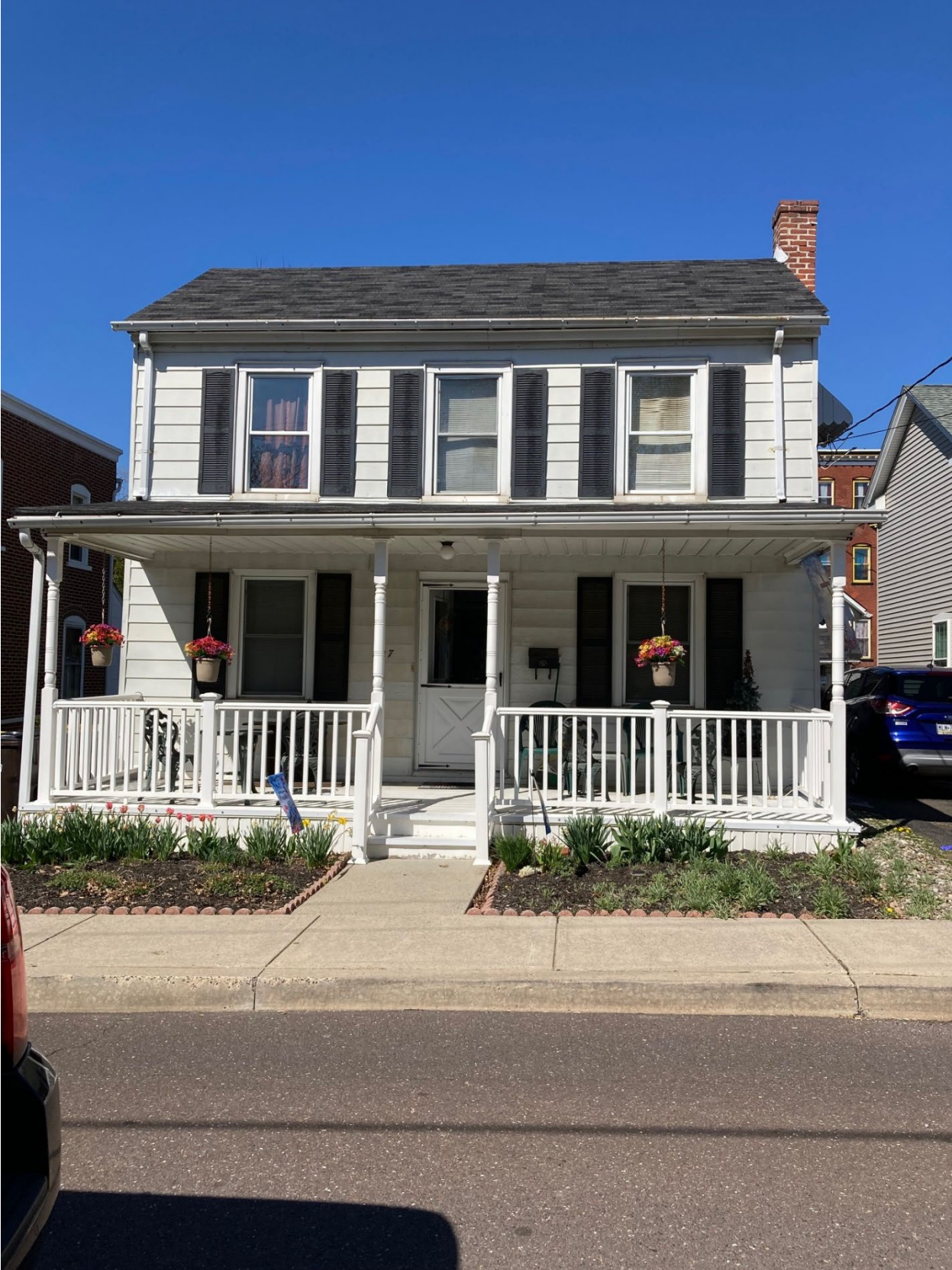
107 N. Fourth St. – Emergency Roof Repair due to rodent infestation