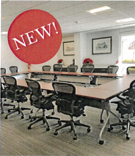
Boardroom Style (up to 20 people)

325 Madison Street, Suite E1004, Lansdale, PA 19446