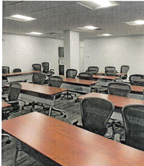
Classroom/Training Style (up to 30 people)