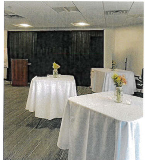
Networking/Social Style (up to 50 people)

Looking to host a beautifully designed, innovation space? The Chamber has you covered! Our conference room rentals are perfect for a variety of gatherings up to 50 people.