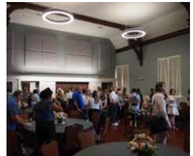
North Wales Arts and Cultural Center Banquet Hall

The North Wales Arts and Cultural Center at 125 N. Main Street has been buzzing with activity since opening its doors in June 2025—and the momentum has only continued to grow. The vision to create a welcoming home for arts and culture is quickly gaining momentum to become a vibrant gathering place for the community.