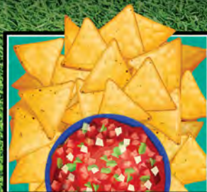
THE RED ZONE