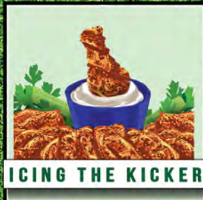
ICING THE KICKER