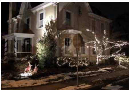
2017 House Decorating Contest Winner

The NWCPA would like to invite you to our annual holiday celebration! Please join us on Sunday, December 2 at the North Penn Volunteer Fire Co. for a fun evening with your family and neighborhood friends.